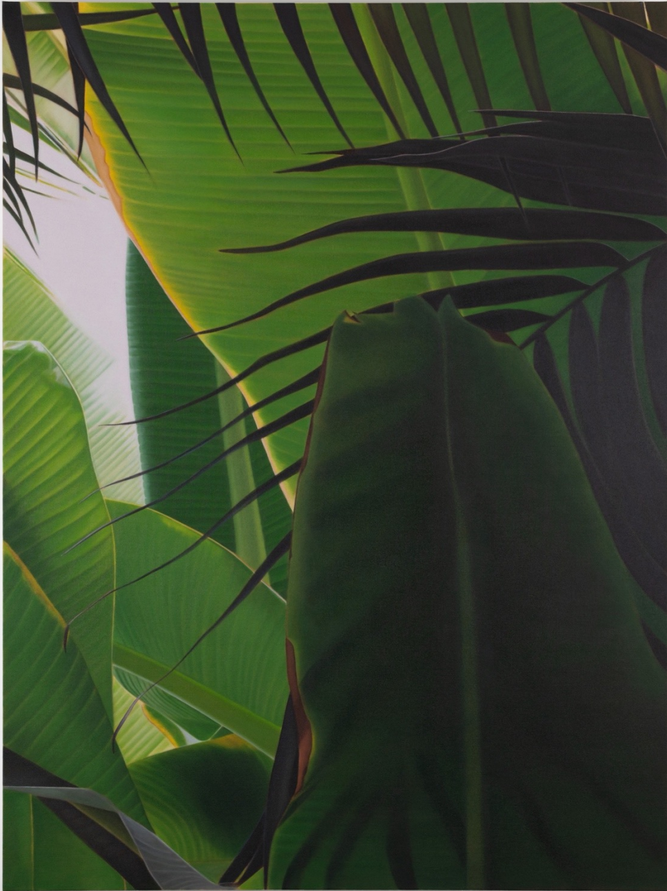
Banana VIII 2021