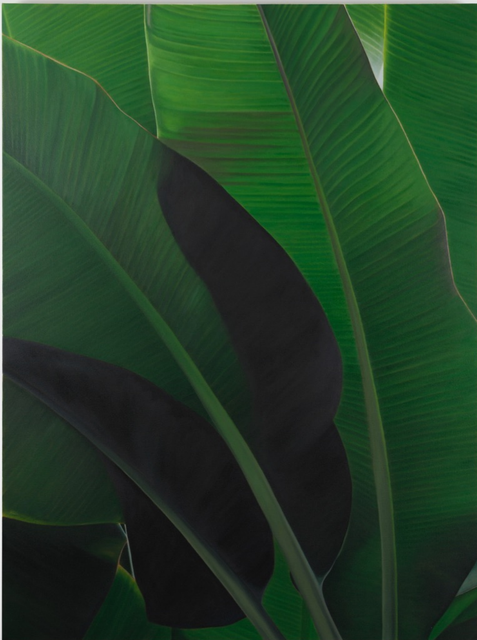
Banana VII 2021