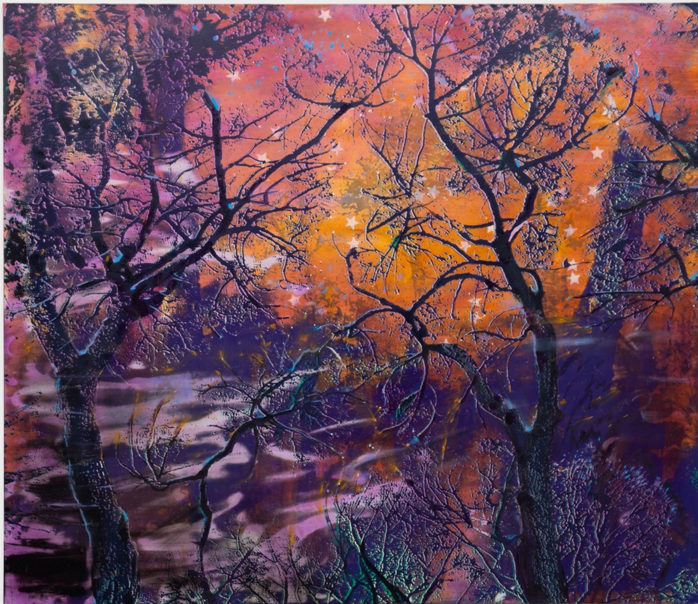
The Sky was all orange (2) 2021 oil and screenprint on canvas 128 x 148 cm / 50.4 x 58.3 in EM40821