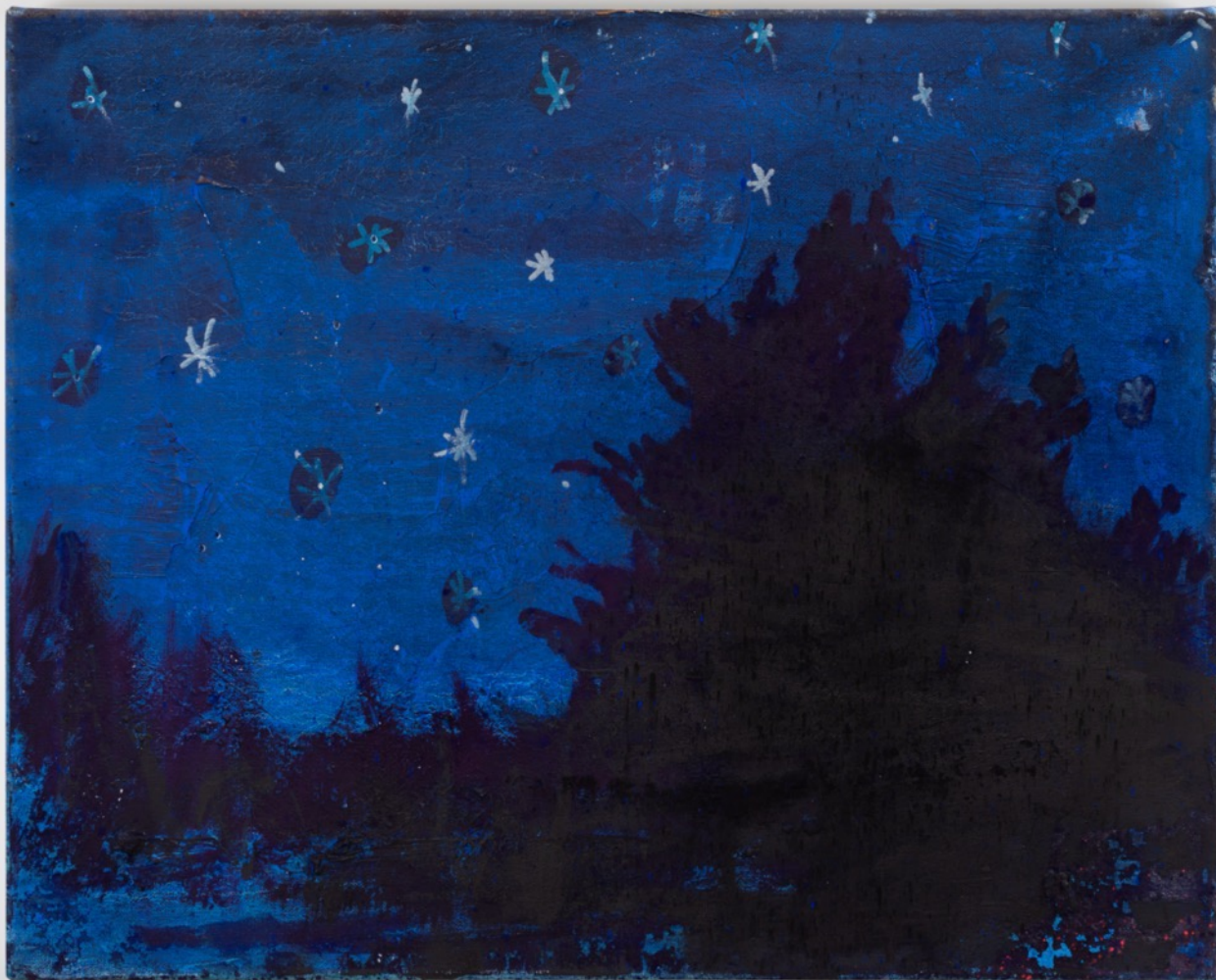
Startime 2021 oil on canvas 41 x 51 cm / 16.1 x 20.1 in EM41221