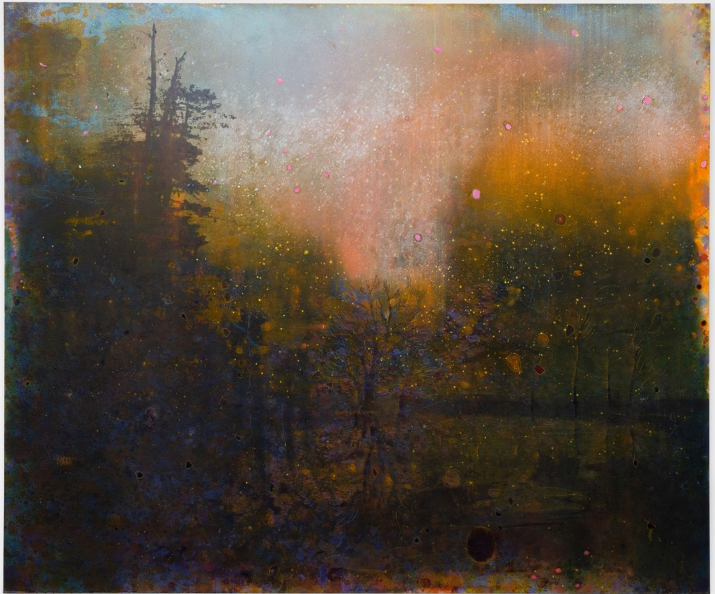
Outlying (1) 2021 oil and screenprint on canvas 153 x 183 cm / 60.2 x 72 in EM40721