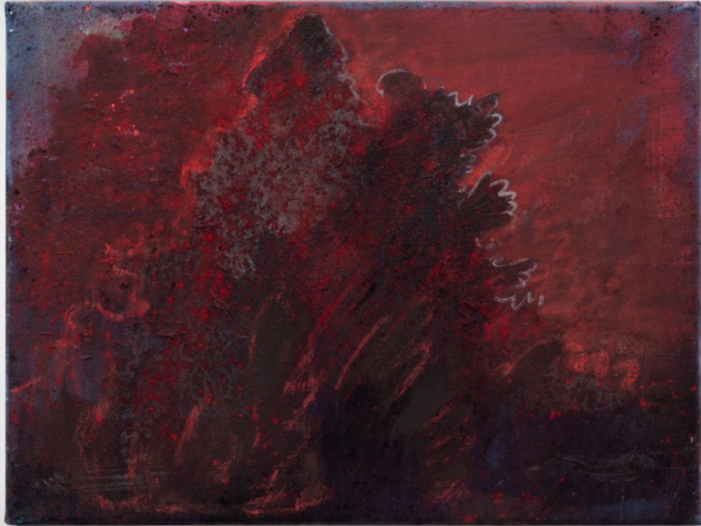
Radial 2021 oil on canvas 30 x 40 cm / 11.8 x 15.7 in EM41621