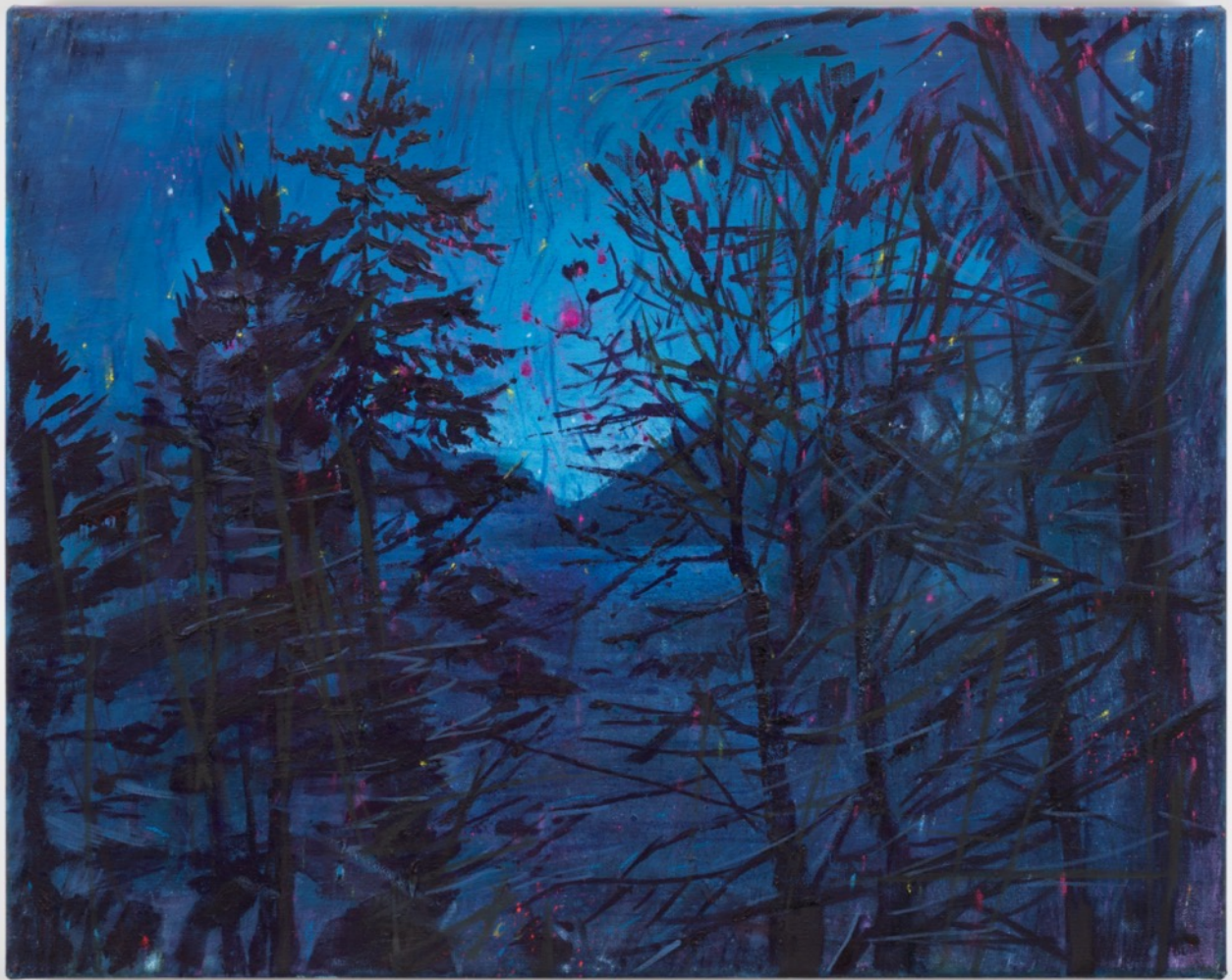
Through and Through 2021 oil on canvas 41 x 51 cm / 16.1 x 20.1 in EM41421