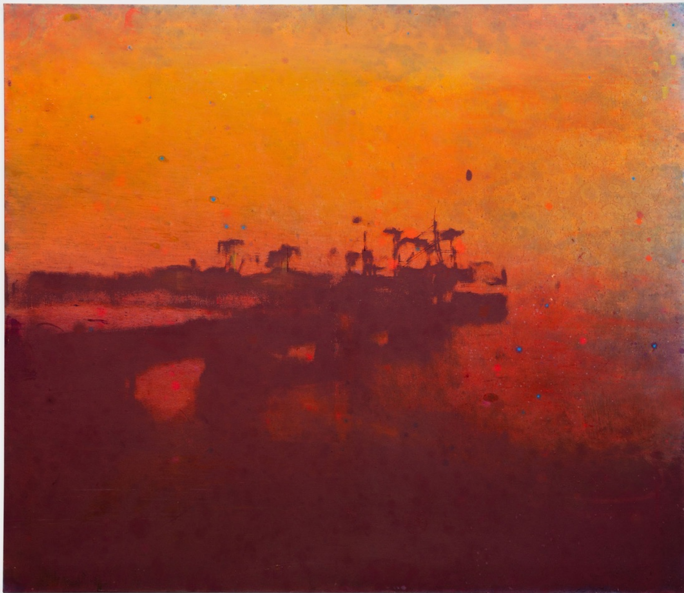
Lough 2021 oil and screenprint on canvas 128 x 148 cm / 50.4 x 58.3 in EM41021