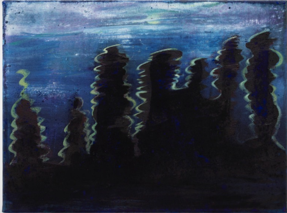
Burgher 2021 oil on canvas 30 x 40 cm / 11.8 x 15.7 in EM41121