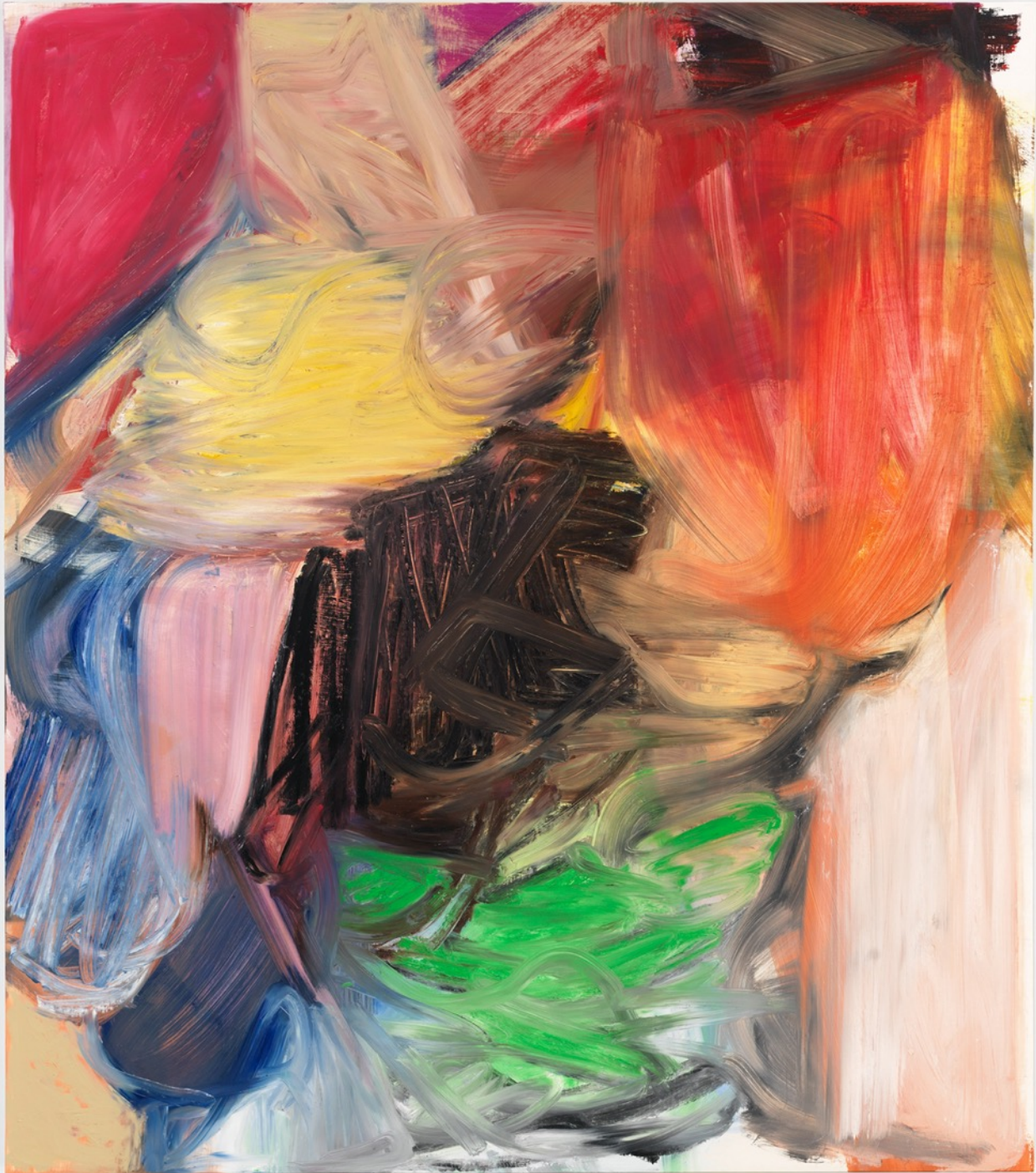
The Magician 2019 Oil on linen, 121.9 x 106.6 cm / 48 x 42 in