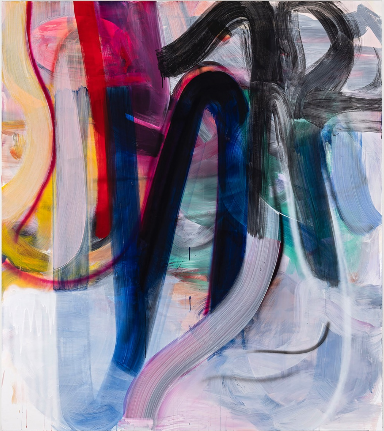
FROM HOT TO COLD 2019 Acrylic on linen 215.9 x 190.5 cm / 85 x 75 in LT3719