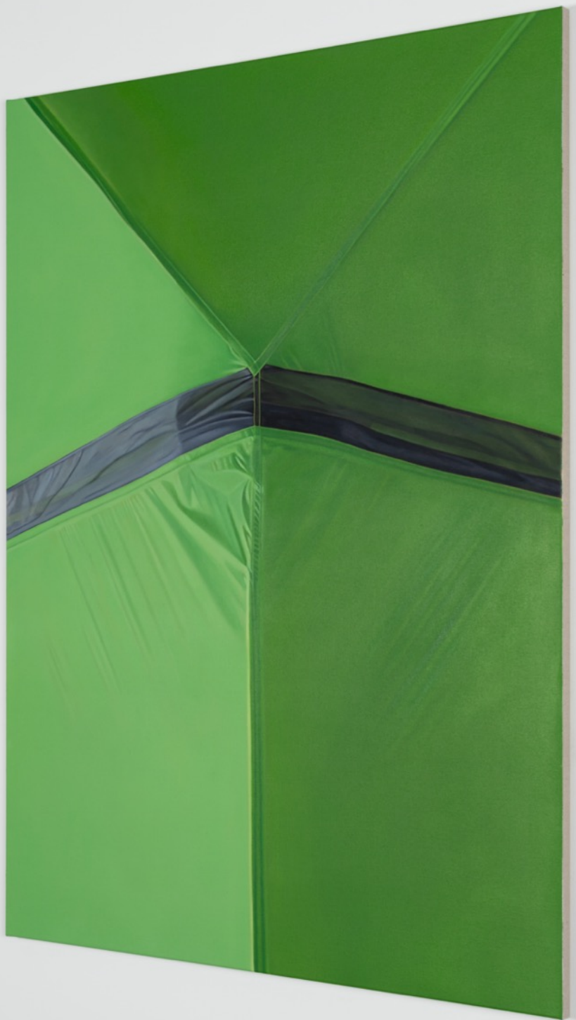
Green 2020 oil on linen 140 x 105 cm / 55.1 x 41.3 in MV03820