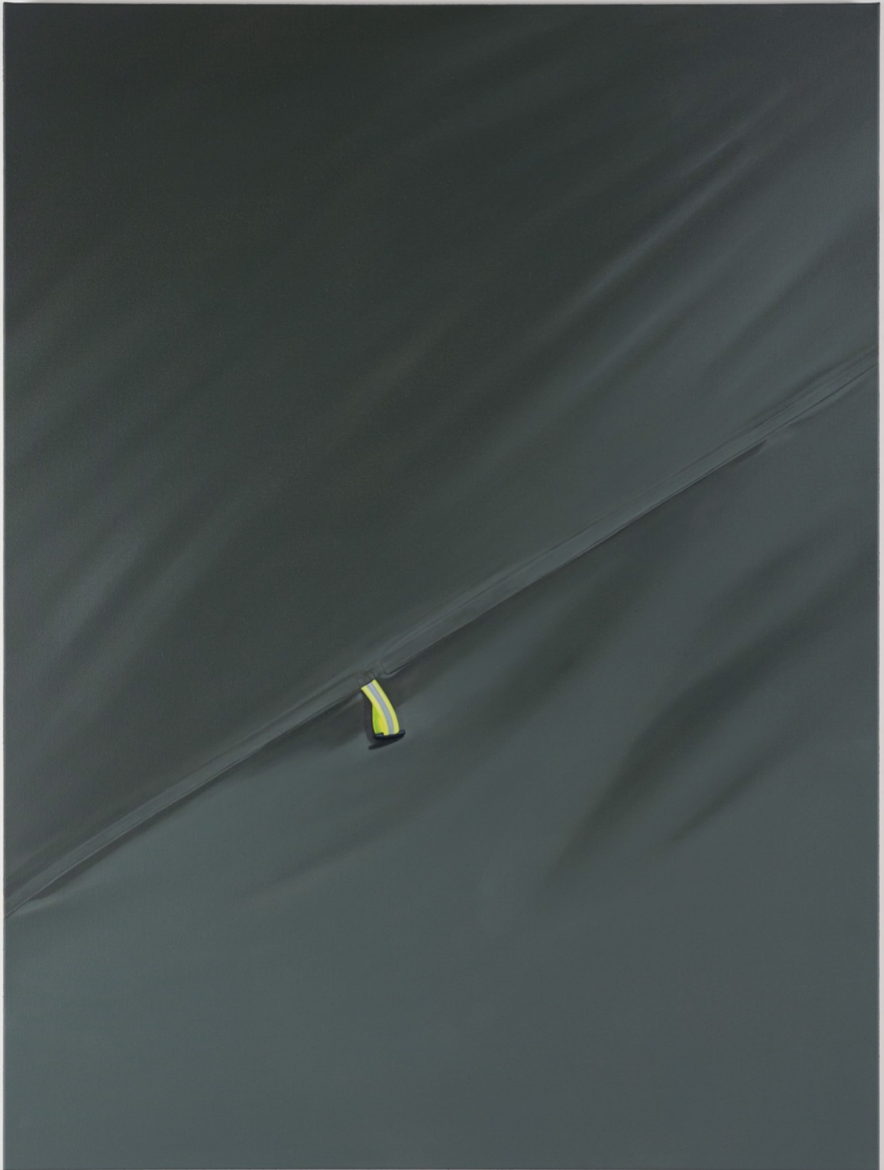
Grey, Yellow, 2020 oil on linen, 140 x 105 cm / 55.1 x 41.3 in , MV03720