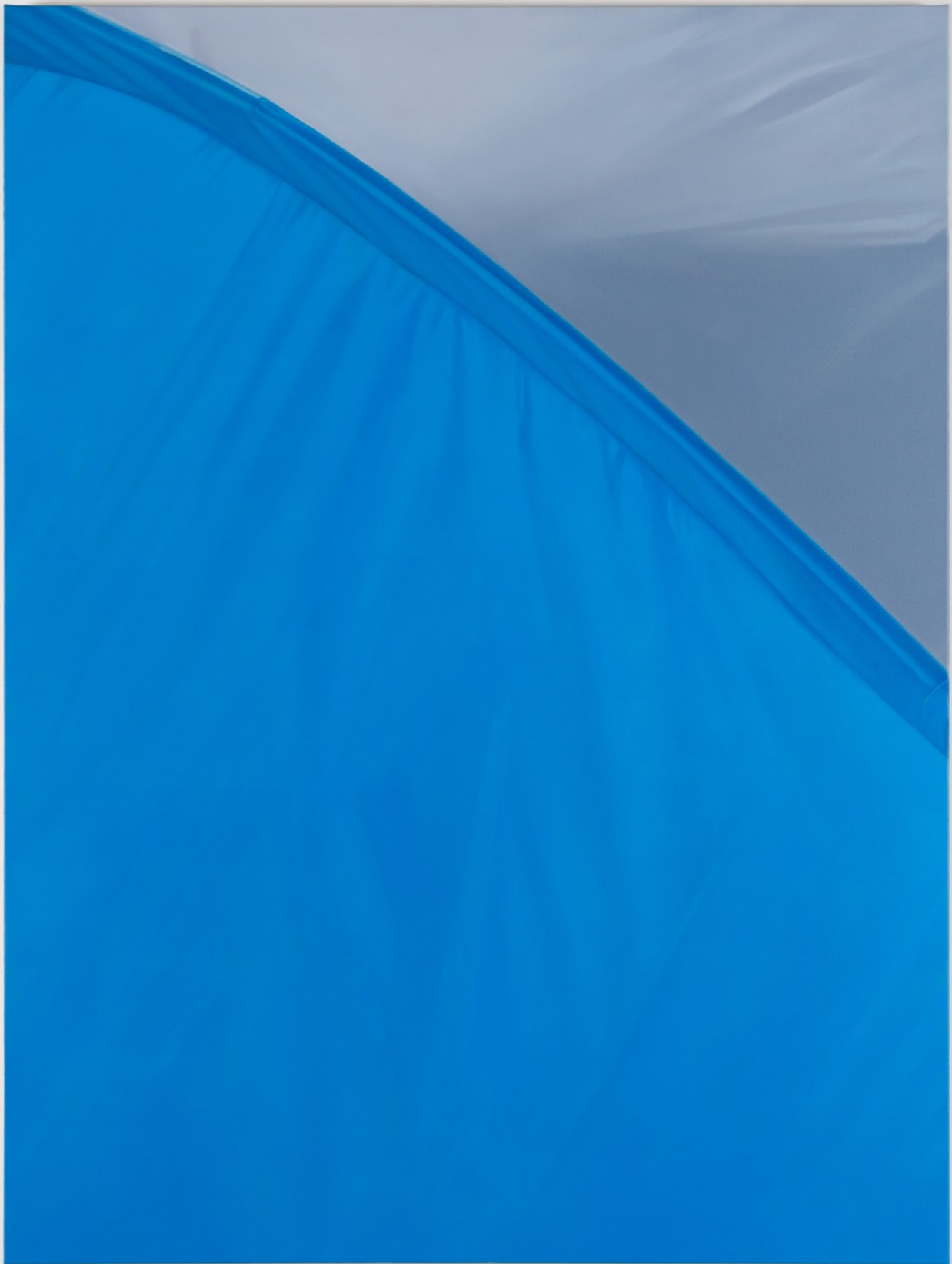
Blue, Grey, 2020 oil on linen, 140 x 105 cm / 55.1 x 41.3 in , MV03920