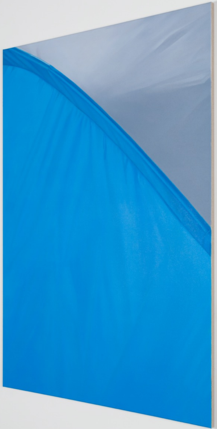
Blue, Grey 2020 oil on linen 140 x 105 cm / 55.1 x 41.3 in MV03920