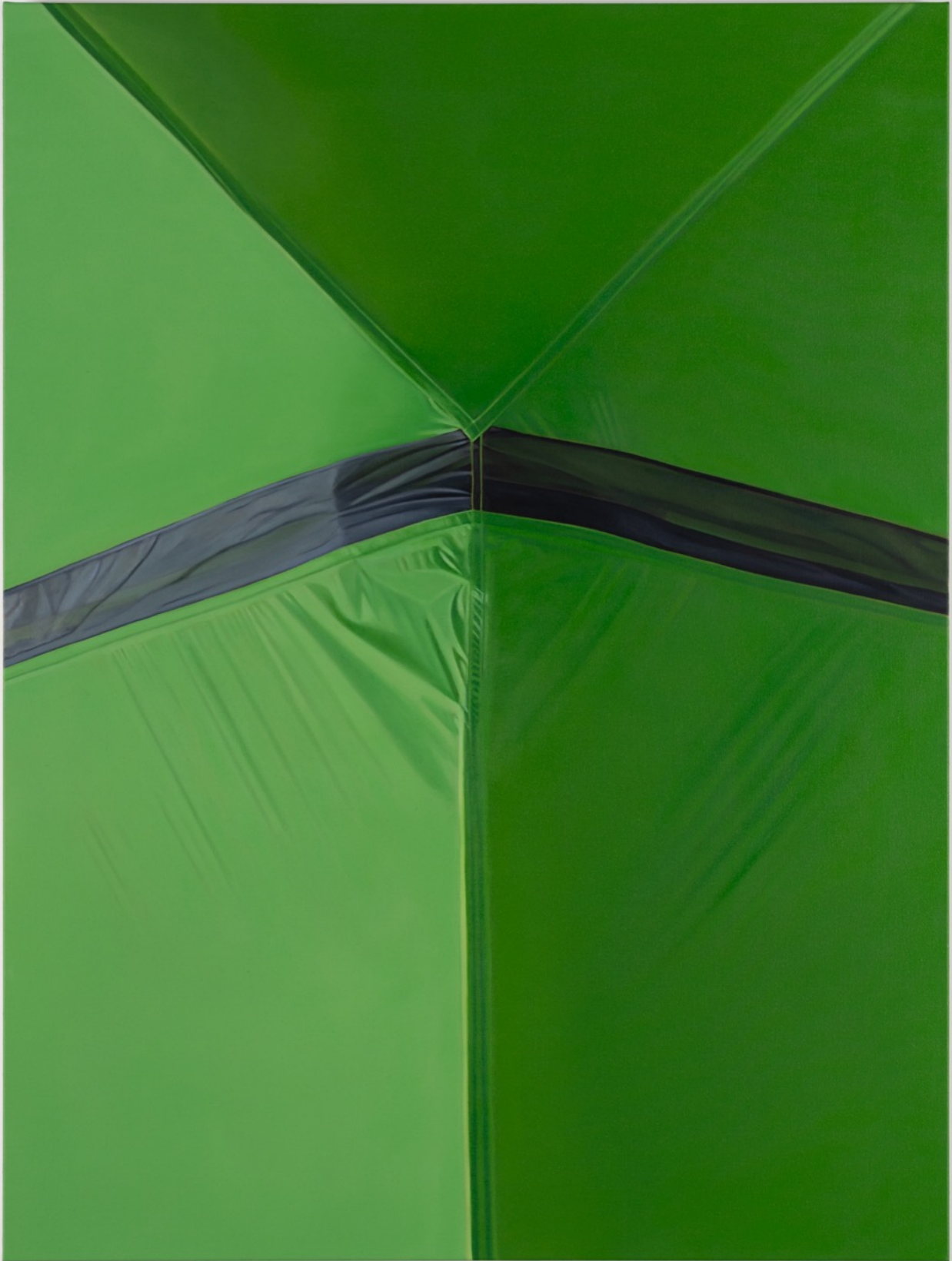
Green, 2020 oil on linen, 140 x 105 cm / 55.1 x 41.3 in, MV03820