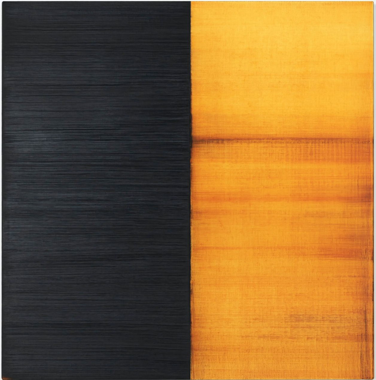
Untitled Lamp Black / Quinacridone Gold 2020 oil on linen 100 x 98 cm / 39.4 x 38.6 in CI C52 2020