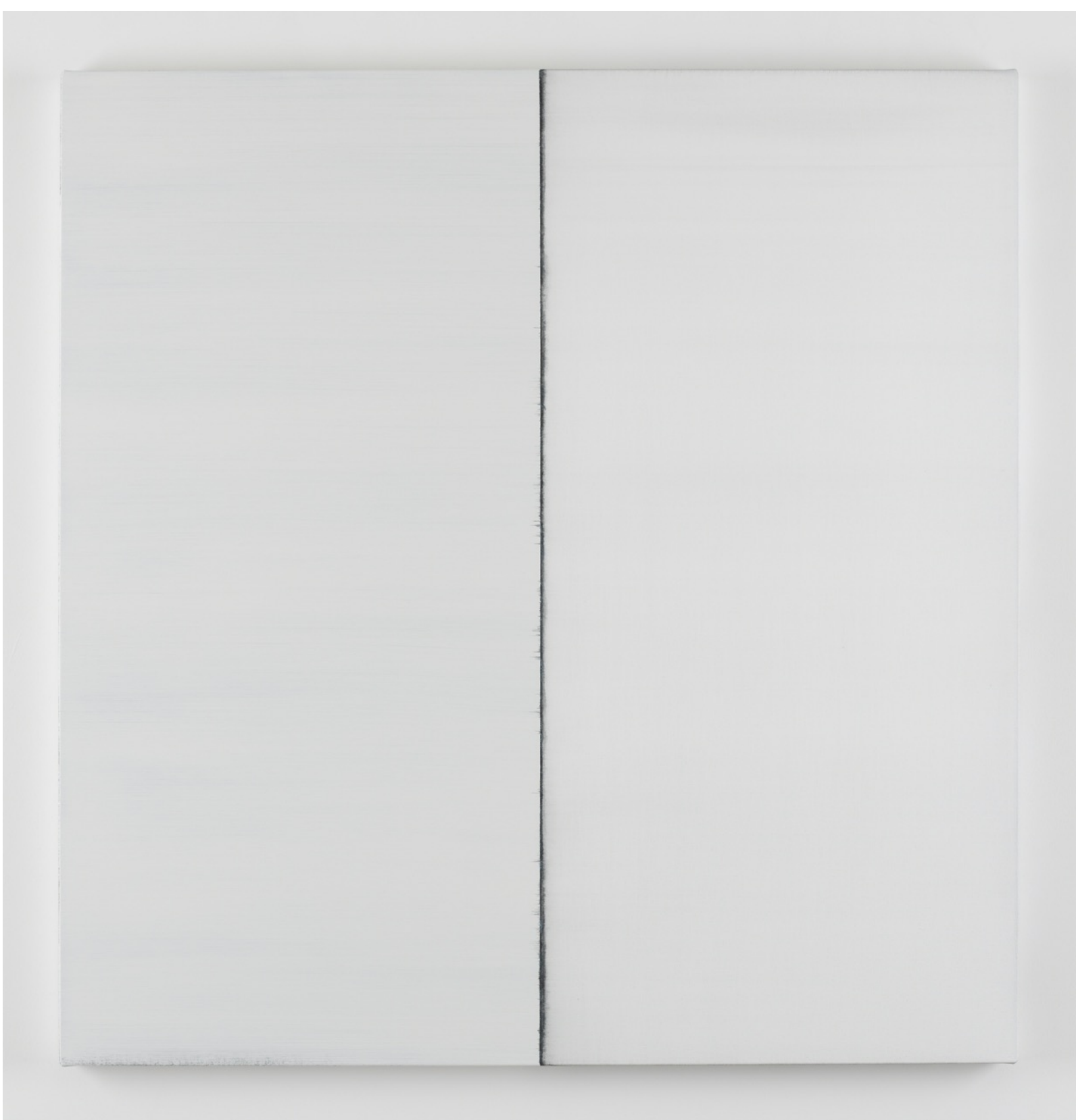
Untitled No. 18 2012 oil on canvas 125 x 121 cm / 49.2 x 47.6 in CIC 42 2012