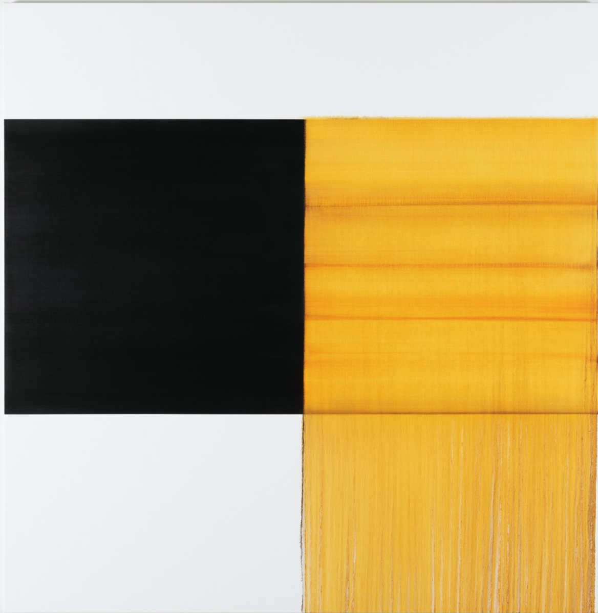
Exposed Painting Quinacridone Gold 2020 Oil on linen 170 x 165 cm / 66.9 x 65 in Cl C 34 2020