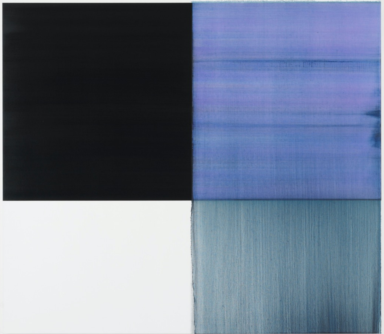
Exposed Painting Blue Violet 2019 oil on linen 160 x 157 cm / 63 x 61.8 in Cl C 41 2019