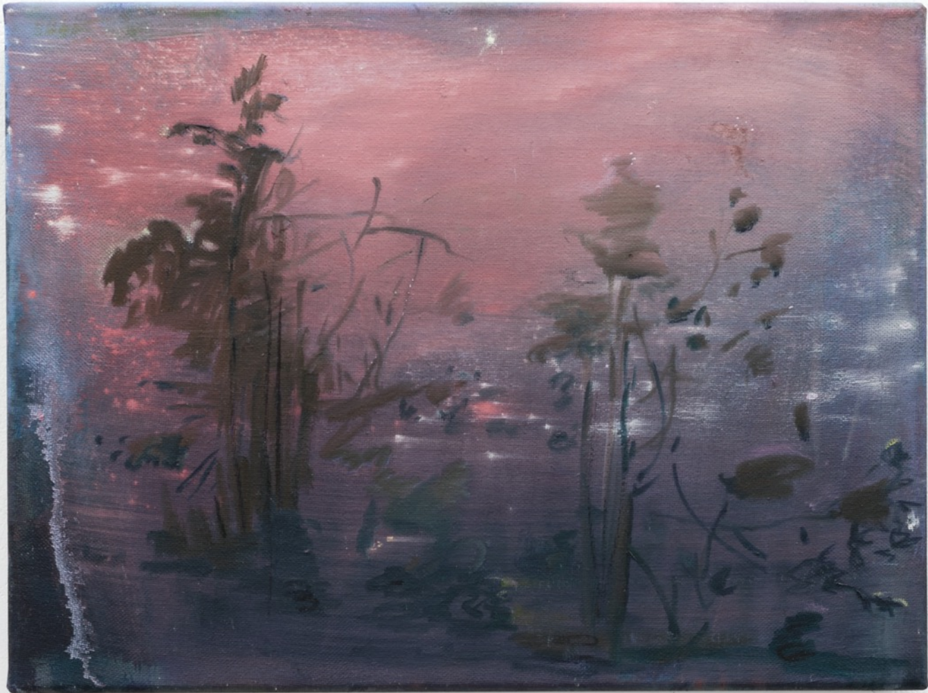
pink mineral 2020 oil on canvas 30.5 x 40.5 cm / 12 x 15.9 in EM39720