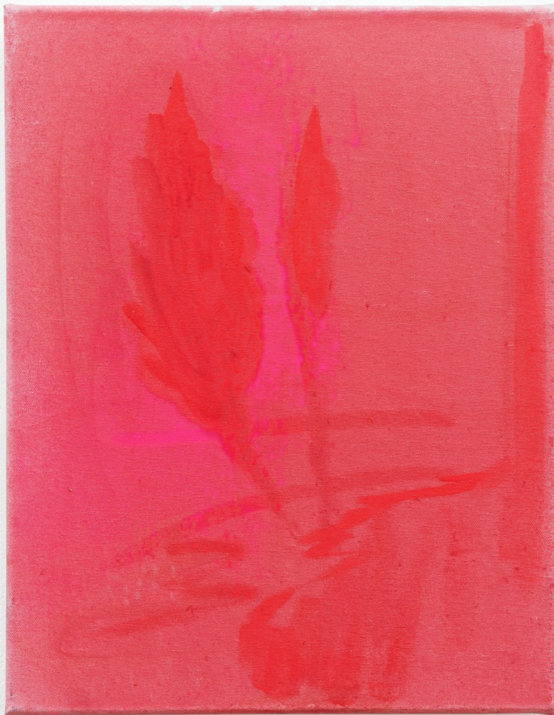
Rose flu, o 2020 oil on canvas 46 x 35.5 cm / 18.1 x 14 in EM40020