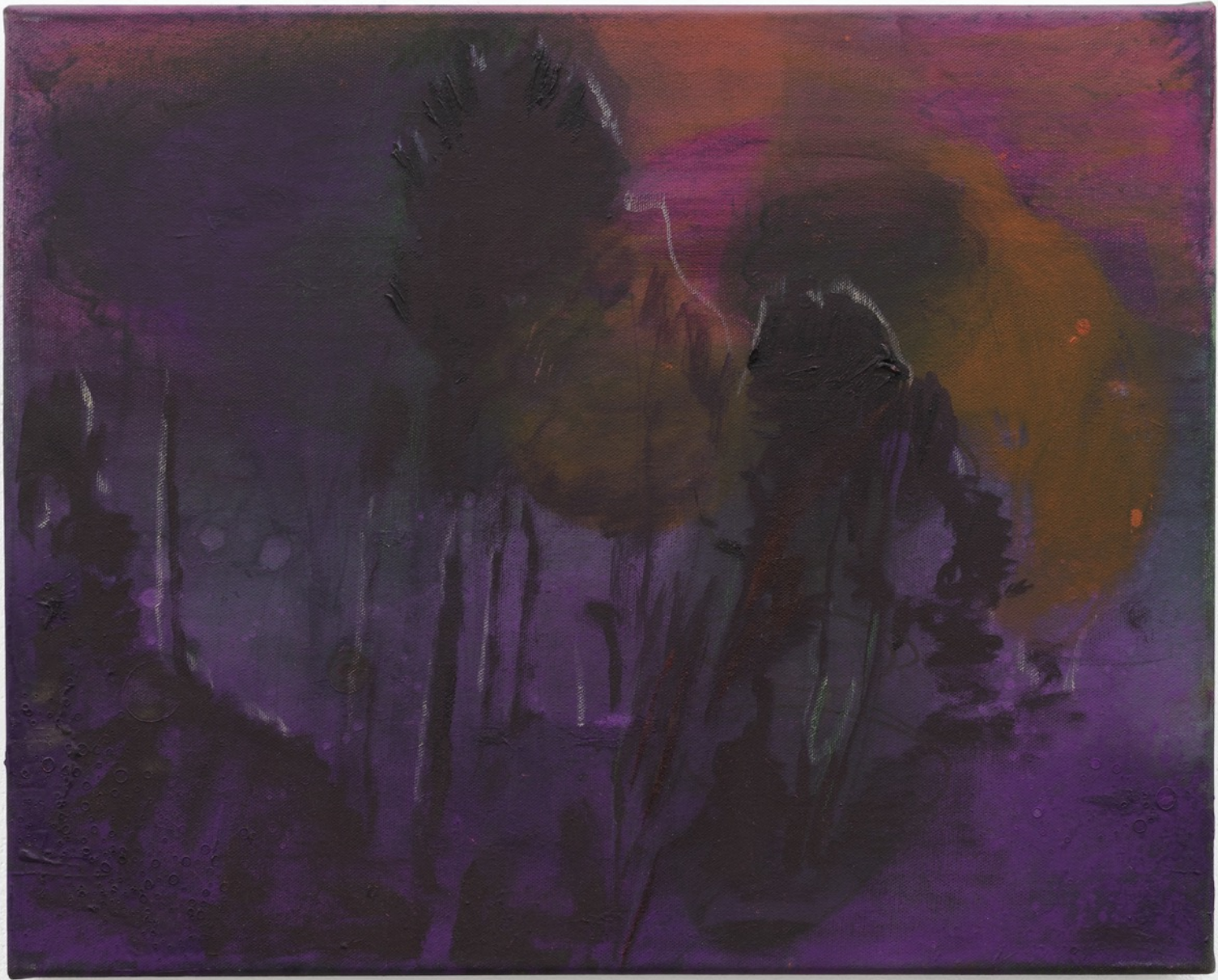
Location 2020 oil on canvas 40.5 x 50.5 cm / 15.9 x 19.9 in EM39220