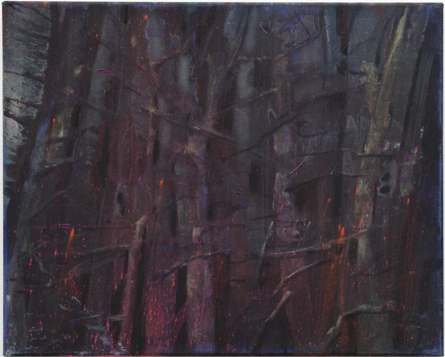
enclosed (1) 2020 oil on canvas 40.5 x 50.5 cm / 15.9 x 19.9 in EM39320