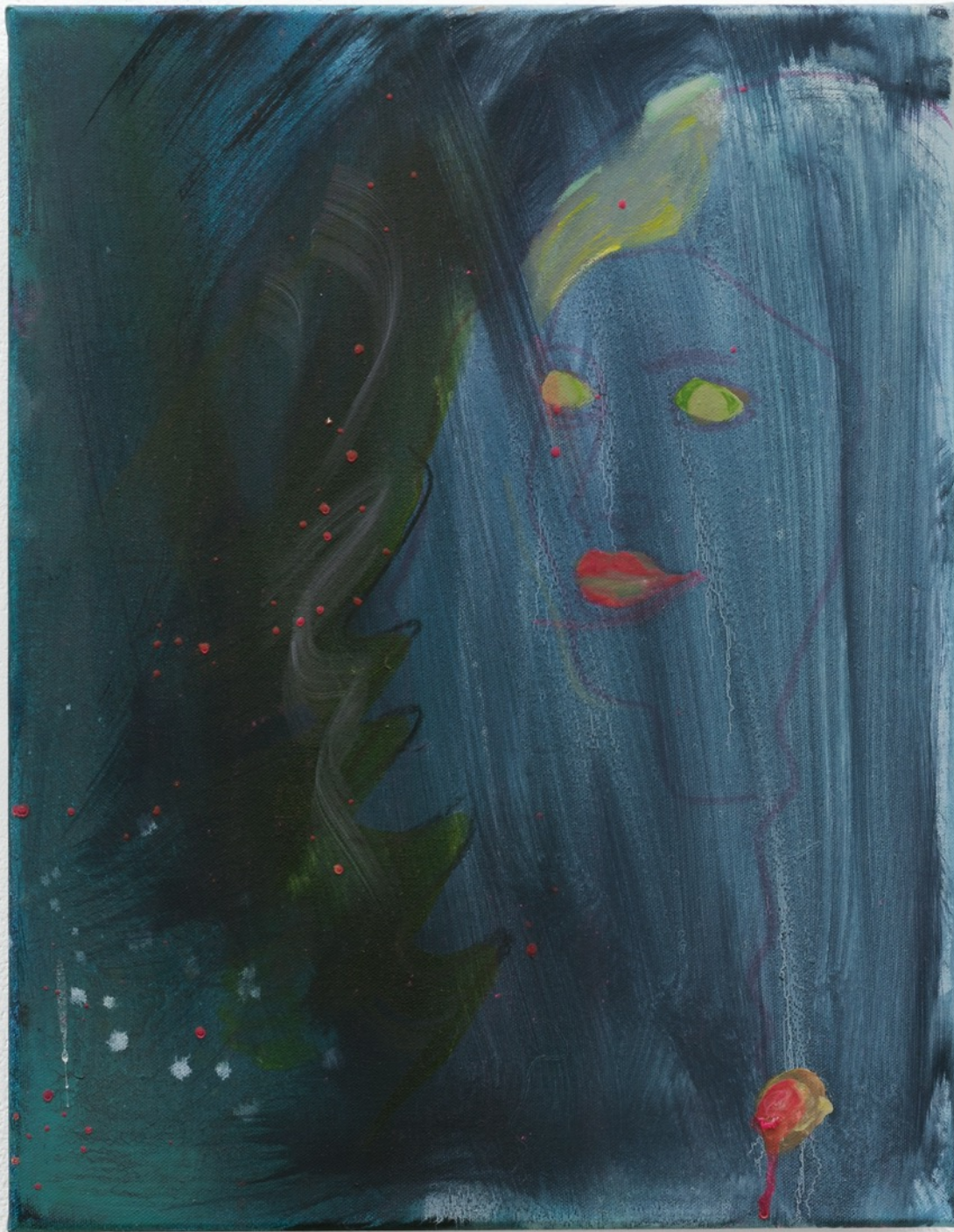
her nature 2020 oil on canvas 46 x 35.5 cm / 18.1 x 14 in EM40120