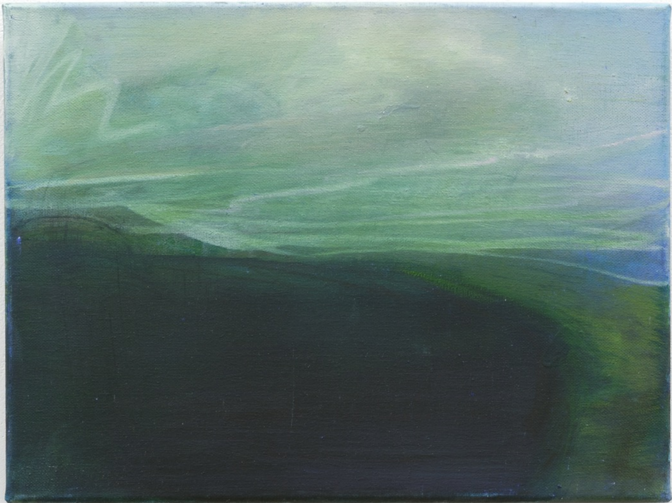
greensound (2) 2020 oil on canvas 30.5 x 40.5 cm / 12 x 15.9 in EM39820