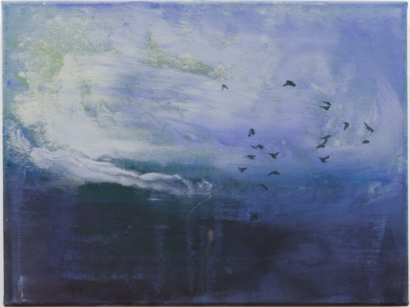
murmur 2020 oil on canvas 30.5 x 40.5 cm / 12 x 15.9 in EM39920