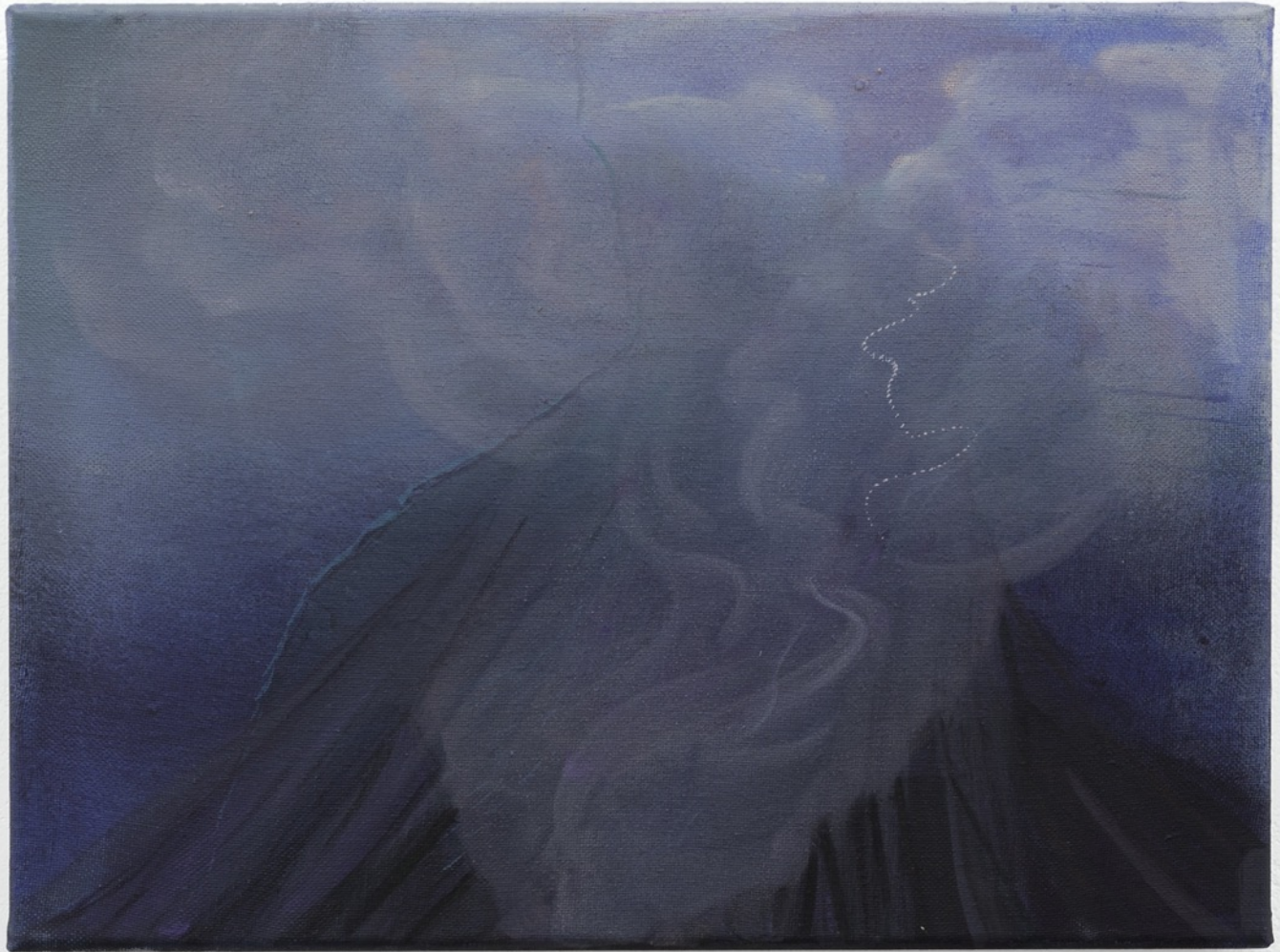
smoulder 2020 oil on canvas 30.5 x 40.5 cm / 12 x 15.9 in EM39520