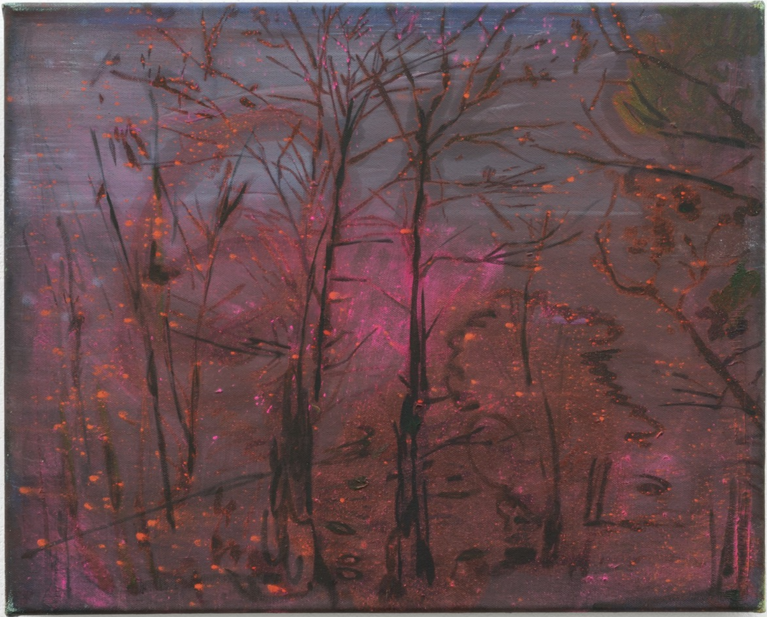
mothlight 2020 oil on canvas 40.5 x 50.5 cm / 15.9 x 19.9 in EM39120