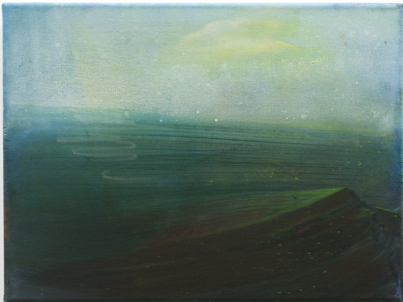
greensound (1) 2020 oil on canvas 30.5 x 40.5 cm / 12 x 15.9 in EM39620